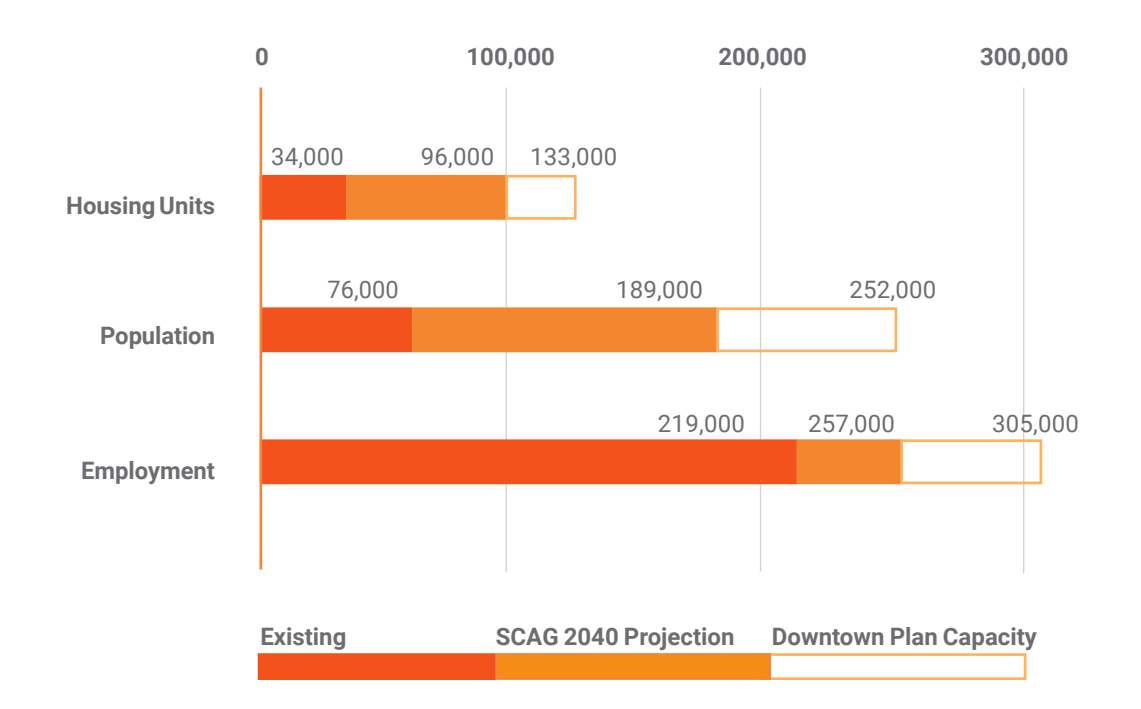
TABLE 1.1: PROJECTIONS & PLAN CAPACITY*

The City must then accommodate, or create the "capacity" for these projected levels of population, housing, and employment through its Community Plans. SCAG's 2040 population and housing forecasts for Los Angeles' Community Plan Areas are based on a number of factors, including historic and recent growth trends. The Department of City Planning allocates the citywide population and housing forecasts, consistent with the Framework Element and other City policies.